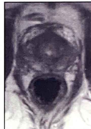
6 month absorption