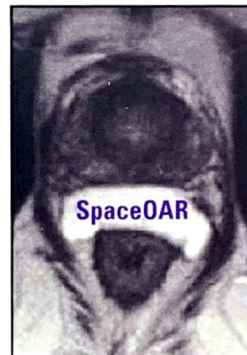
3 month persistence